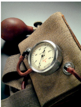
'manometro in Italian means pressure gauge'